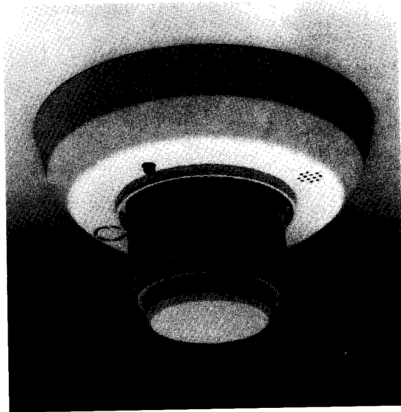
Detector Base Shown with R7 Detector